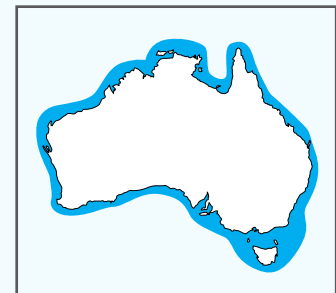
Distribution in Australian waters