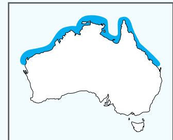
Distribution in Australian waters