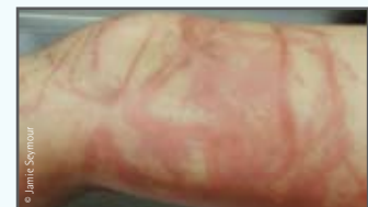
Severe Chironex sting